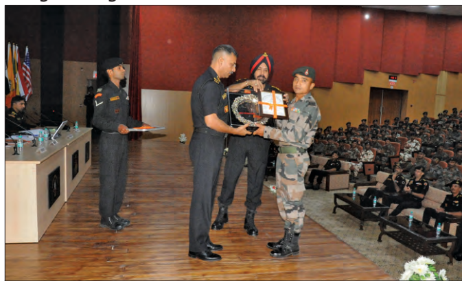
RARING TO GO

Another batch of 830 spirited commandos, eager to don the Black Dungarees , got inducted post the gruelling CCC- 3&4.