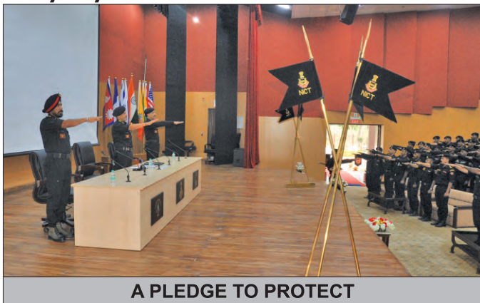
A PLEDGE TO PROTECT

Rank & file of NSG came together to pledge their commitment to nation building on the National Unity Day .