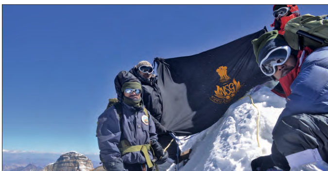
IMPRINTING GLORY ON ICY HEIGHTS

In another first, a NSG Motorcycle Expedition Team was flagged off by Shri Kiren Rijiju, Honourable Minister of State for Home Affairs, Govt of India on 07 Sep 2017. In a superlative effort of endurance & perseverance, the 34 member team travelled for 40 days across 13 States, covering almost 8000 Kms to generate awareness about the "Need for Collective Responsibility" to fight terrorism as one strong nation . The overwhelming response of the citizenry & State Police Forces for the cause has strengthened our resolve to protect the nation with all our might.