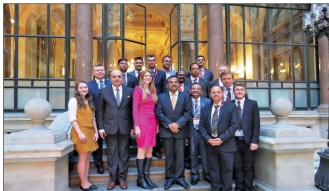
TOGETHER WE STAND