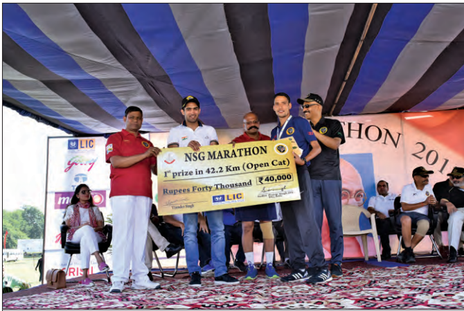
FIRST AMONGST EQUALS

The Marathon fever caught up with the campus, with almost the entire garrison seen practising at all conceivable hours. The mega event on the Gandhi Jayanti saw enthusiastic participation from all age groups ranging from 05 yrs to 65 yrs in various categories. Iconic Pugilist, Vijender Kumar added the glamour quotient, giving away prizes, while throwing a few shadow punches to the crowd's delight. Everyone once again put on their running shoes for the "Run for Unity" to mark the Rashtriya Ekta Diwas .