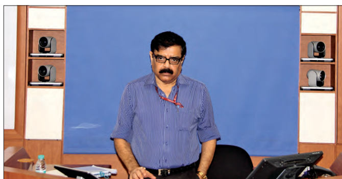
KEEP THE LAMP BURNING

The desire for learning has been getting stronger over the past one year. The stimulating sessions on national security issues have lit up the fire for greater seeking. Incisive lectures from leading strategists have kept the momentum going.