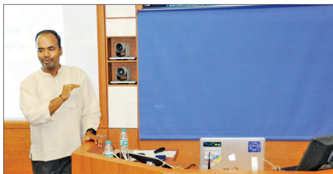
DEEP, DARK WEB OF SOCIAL MEDIA