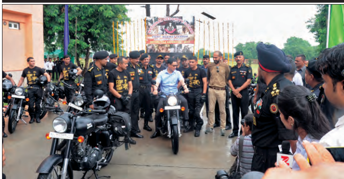
YES MINISTER...LET'S GO

In another first, a NSG Motorcycle Expedition Team was flagged off by Shri Kiren Rijiju, Honourable Minister of State for Home Affairs, Govt of India on 07 Sep 2017. In a superlative effort of endurance & perseverance, the 34 member team travelled for 40 days across 13 States, covering almost 8000 Kms to generate awareness about the "Need for Collective Responsibility" to fight terrorism as one strong nation . The overwhelming response of the citizenry & State Police Forces for the cause has strengthened our resolve to protect the nation with all our might.