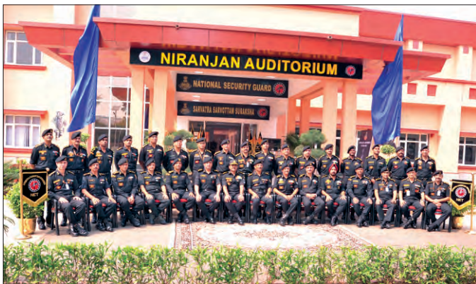
DRIVING THE STRATEGY FOR FUTURE

The Annual Group Commanders Conference on 11 & 12 Oct 2017 saw the entire senior leadership of NSG descend on the Manesar Garrison to discuss the future strategy. Two days of threadbare discussions have provided the direction for future course of action.