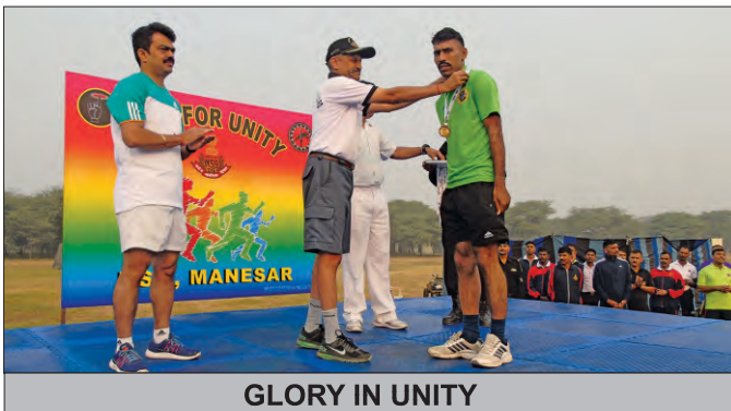
GLORY IN UNITY

The Marathon fever caught up with the campus, with almost the entire garrison seen practising at all conceivable hours. The mega event on the Gandhi Jayanti saw enthusiastic participation from all age groups ranging from 05 yrs to 65 yrs in various categories. Iconic Pugilist, Vijender Kumar added the glamour quotient, giving away prizes, while throwing a few shadow punches to the crowd's delight. Everyone once again put on their running shoes for the "Run for Unity" to mark the Rashtriya Ekta Diwas .