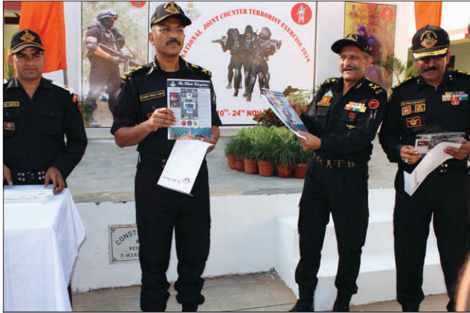
BEGINNING OF A NEW CHAPTER

The DG released the first edition of "The Black Dungarees" on 10 Nov 2016 in the presence of an impressive audience of 125 IPS probationers who were also the first recipients. The encouraging response to the initiative has spurred us on to continue to share with our patrons. A Calendar has been published to highlight the commendable journey of the Black Cats through the year.