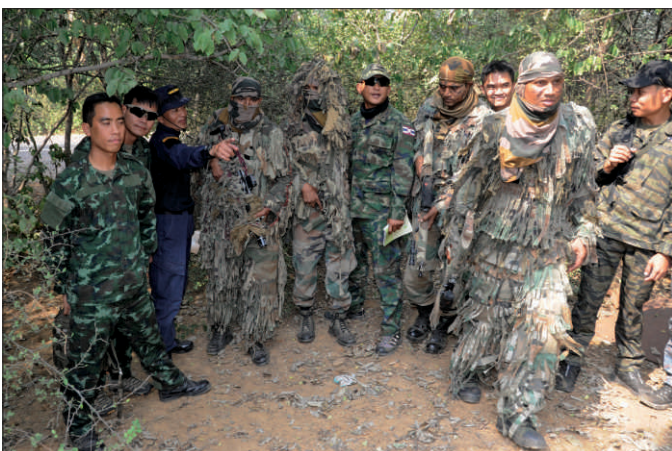
MĀE! WHERE DID HE COME FROM

A contingent of Thai SF carried out Joint CT Exercise from 24 Oct to 05 Nov 2016