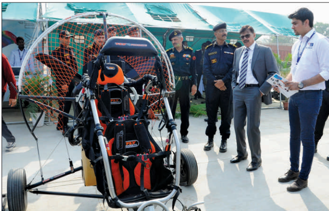
FLY ME INTO THE FUTURE

Equipment Display Several new equipment were displayed during the two national exercises to give a peek into the technology of the future to assist SF. Participants evinced keen interest in the exhibitions, also encouraging the "Make in India" drive.