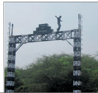
MODERNISING FOR THE FUTURE