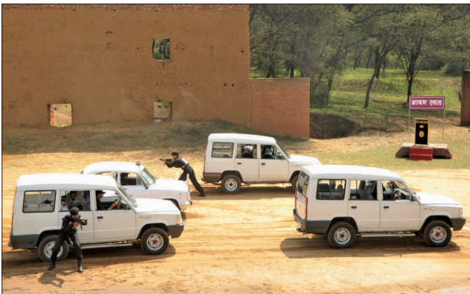
IN THE LINE OF FIRE

The Black Cats continued to sharpen their fangs while training for any eventuality. The teams prepared for various scenarios in different contingencies. From protecting VIPs to metros, airports, trains; to hotels, stations and other high value target around the country, seamless coordination was achieved with all stake holders.