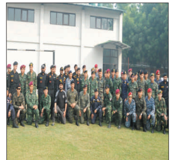
YUMMY! INDIAN THAI CURRY

A starry eyed batch of 125 IPS Probationers visited HQ NSG and the Manesar Garrison to get a feel of the Force. They left obviously impressed.