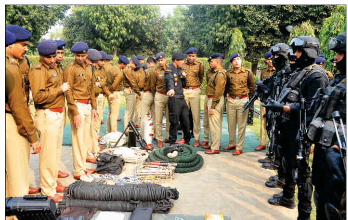
WOW! MUST BECOME THEIR DG SOON

A starry eyed batch of 125 IPS Probationers visited HQ NSG and the Manesar Garrison to get a feel of the Force. They left obviously impressed.