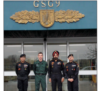
ACHTUNG! RUBBING SHOULDERS