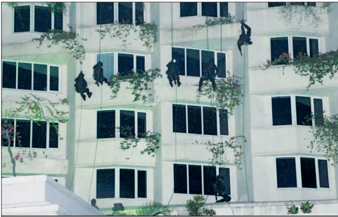
EVERYWHERE FROM ANYWHERE

The Black Cats continued to sharpen their fangs while training for any eventuality. The teams prepared for various scenarios in different contingencies. From protecting VIPs to metros, airports, trains; to hotels, stations and other high value target around the country, seamless coordination was achieved with all stake holders.