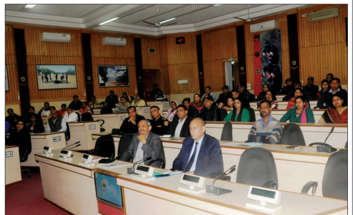
WE ARE ALWAYS WITH YOU

A clientele meet was organised in the Manesar Garrison on 07 Jan 17 to obtain a direct feedback about the various administrative issues of all ranks with a view to improve the quality of life.