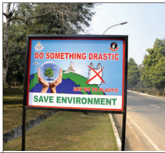
WE OWE IT TO OUR POSTERITY