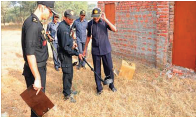
WATCHOUT! THERE'S A BOMB

Close on the heels came the 2nd National Counter IED Exercise: Agnishaman-II from 01-08 Dec 2016. Counter IED teams from eight states & CISF shared their best practices while learning a trick or two from the experts of National Bomb Data Centre, NSG . With the country facing the IED menace in every nook & corner, this exposure prepared them to effectively deal with several peculiar scenarios which the BD teams face frequently.