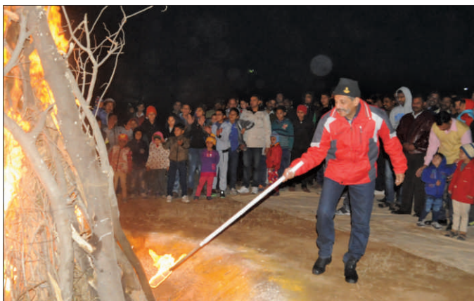
SPREADING WARMTH AROUND WITH LOHRI

The New Year festivities saw the fraternity come out in large numbers to celebrate, with Lohri adding to the flavour.