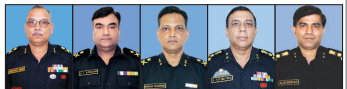
TOWARDS GREENER PASTURES