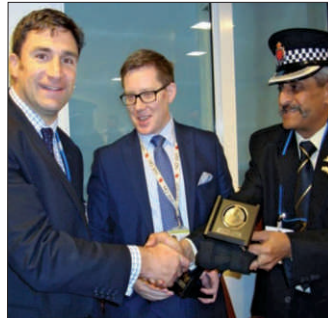
WITH SAS - BONHOMIE AMONGST EQUALS