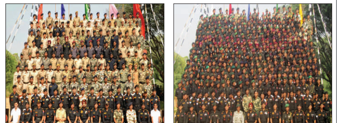
VOILA! READY FOR BLACK DUNGAREES

Flagship Courses. After a gruelling 12 weeks, Conversion Courses SAG-102 & SRG-106 concluded successfully in Dec 2016 with induction of 217 & 138 Commandos , respectively. 126 Police Commandos were also trained over 12 weeks to be trainers.