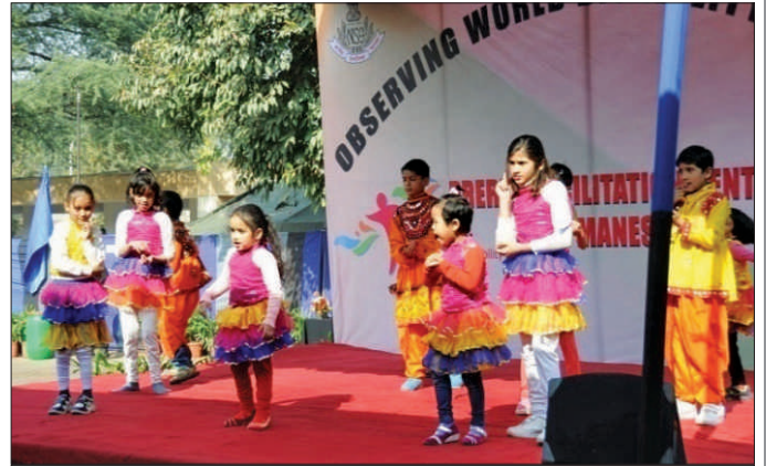
DANCING AWAY THE CHALLENGES

the differently abled children gave a wonderful expose into their beautiful minds.