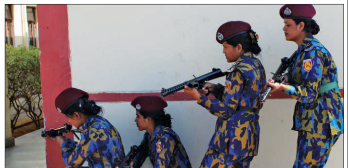
MORE THAN A MATCH

The Police Training Group (PTG) oversaw the flawless conduct of Agni Pariksha-III, the 3rd National Joint CT Exercise. Crack CT teams from 10 states and a team of 11 SRG took part in the exercise from 10-24 Nov 2016. In a special effort, the gp trained 40 personnel of Bangladesh Police including officers and ladies of RAB, Metro & Armed Police.