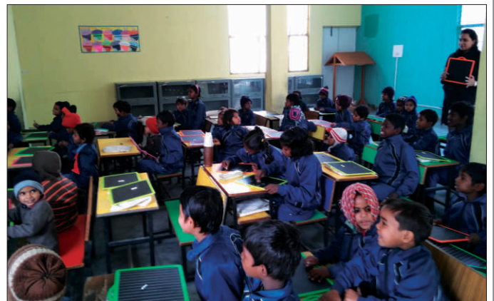
TOWARDS A BETTER FUTURE

In a heartwarming gesture, the DG opened NSG's doors for the labourers working on the campus by providing schooling facilities & food for their young children.