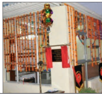
LEADING THE WAY