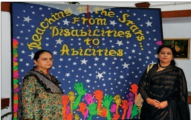
"TARREY ZAMEEN PAR"