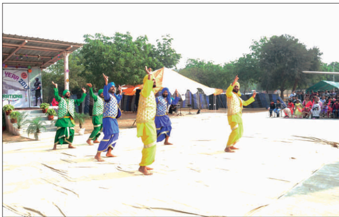
USHERING IN THE NEW YEAR

The New Year festivities saw the fraternity come out in large numbers to celebrate, with Lohri adding to the flavour.