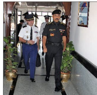
MAMMA MIA! THEY ARE A STEP AHEAD