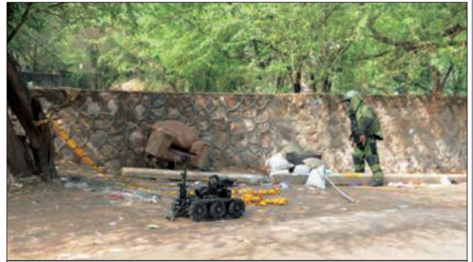
SLEEP WELL! WE WILL KEEP YOU SAFE

The bomb disposal team responded swiftly to an emergency to defuse a live bomb found in a residential area in Delhi on 28 Jan 17 once again displaying remarkable skills and courage.