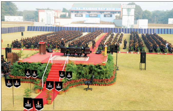
EXCEL! THE NATION HAS FAITH

The DG addressed all ranks of the NSG on 02 Jan 2017, priming them for the challenges ahead.