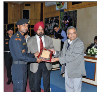
MAKING US PROUD

The impetus on modernisation and up gradation is manifesting in the mushrooming of several critical facilities which aim to enhance the overall standard of training and living of the Black Cats . A state of the art Niranjan Auditorium with a virtual classroom, 580 men barrack, innovatively designed confidence jump, IED Modular Range, modern equipment like ROVs & target systems will add to the world class infrastructure in Manesar Garrison.